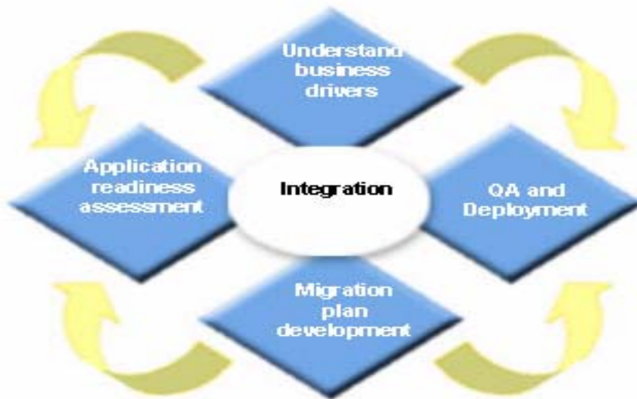
Application Migration Framework